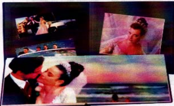
"Edge to Edge" Double Page Panoramas