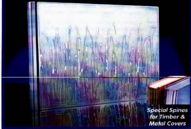
Special Spines for Timber & Metal Covers