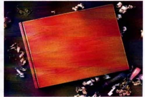
Australian Timber Covers